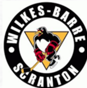
Wilkes-Barre Penguins Community Inclusion Award